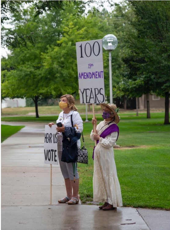
Figure 2. Photos from the 100 th Anniversary celebration of the 19 th Amendment.

https://www.northern.edu/news/student-restarts-northerns-chapter-college-republicans