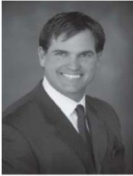
COMMISSIONER Jarrod Johnson